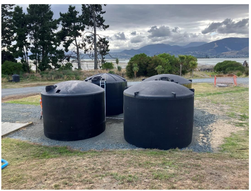
Figure 4: Greenacres Reuse Supply Tanks

causeway have commenced and is scheduled for completion in late February.