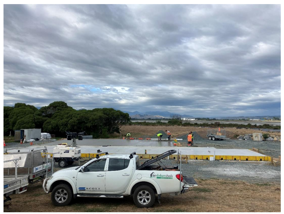
Figure 3: Facilities/Workshop Building Foundation