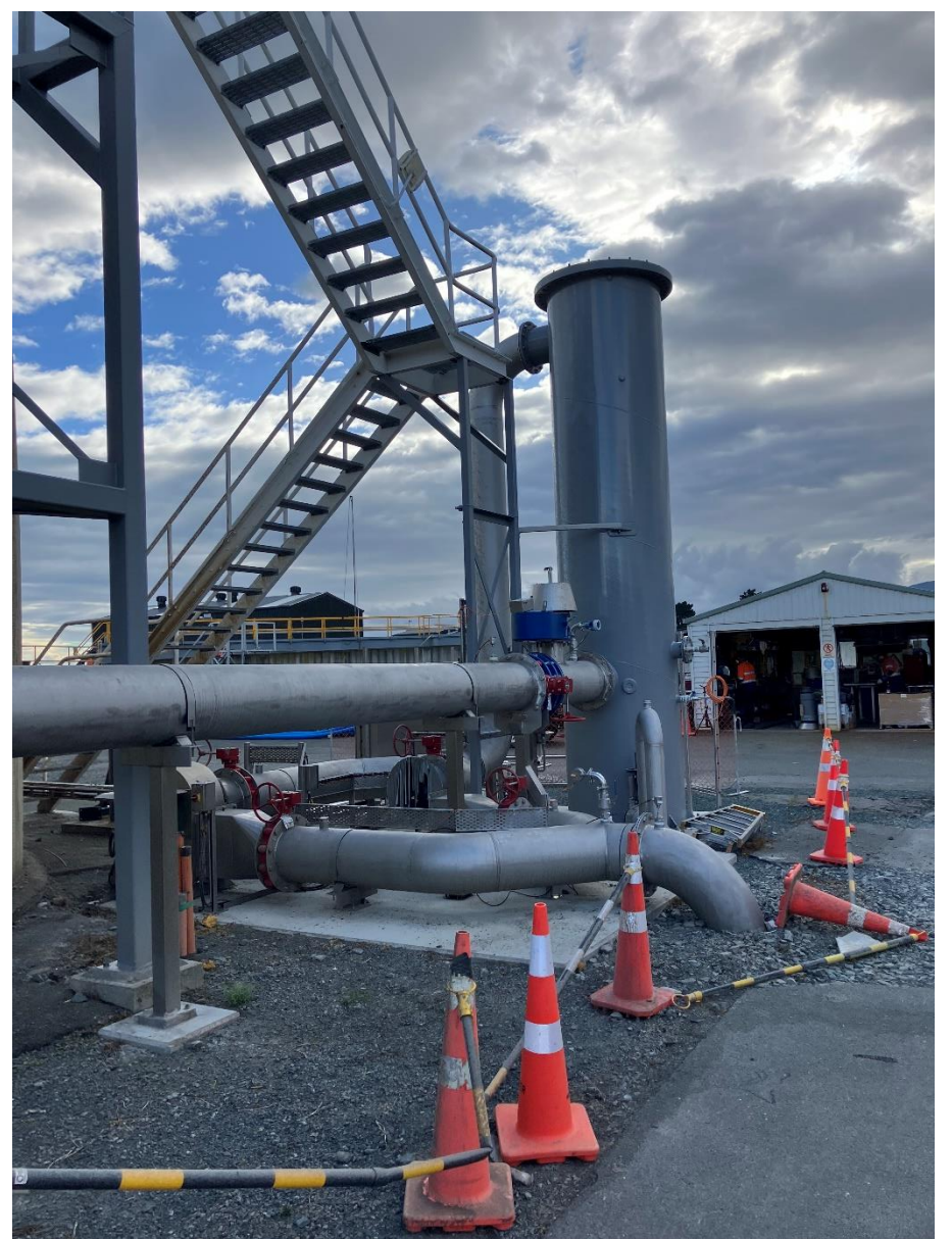
Figure 2: ADAT Ammonia Scrubber & Blowers