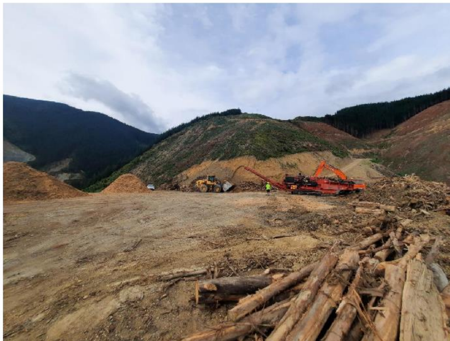
Mulching slash at the Marsden forest to reduce environmental risk and improve aesthetics of the area.