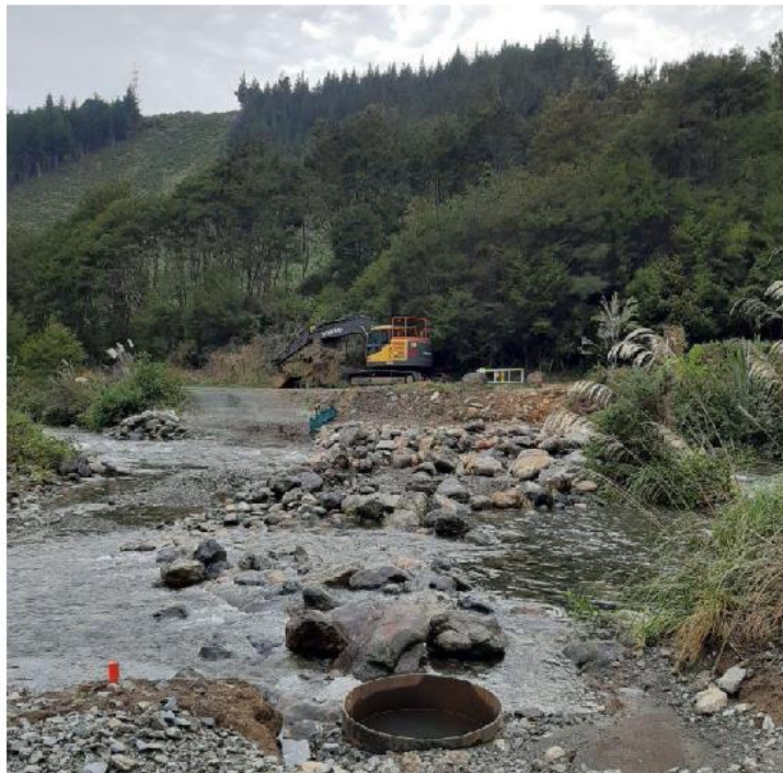
Below-ground structural work being completed on the Maitai South Branch bridge