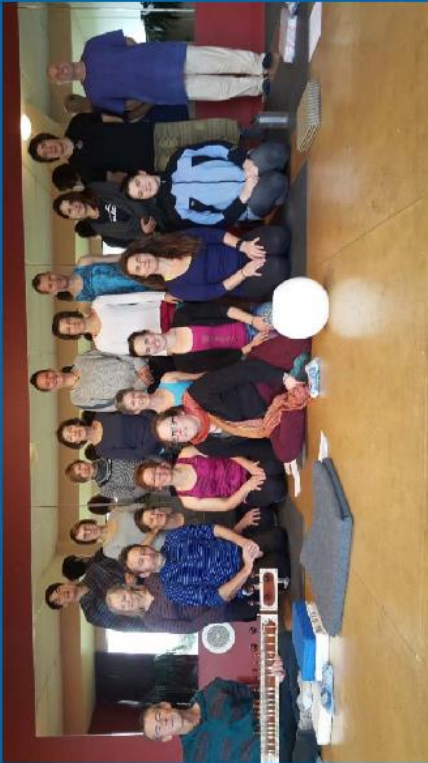
Chaitanya's yoga studio