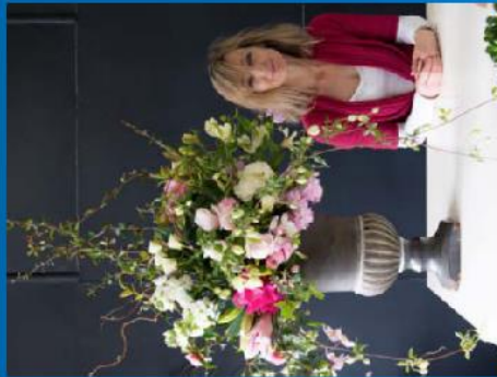
Willow Floral design