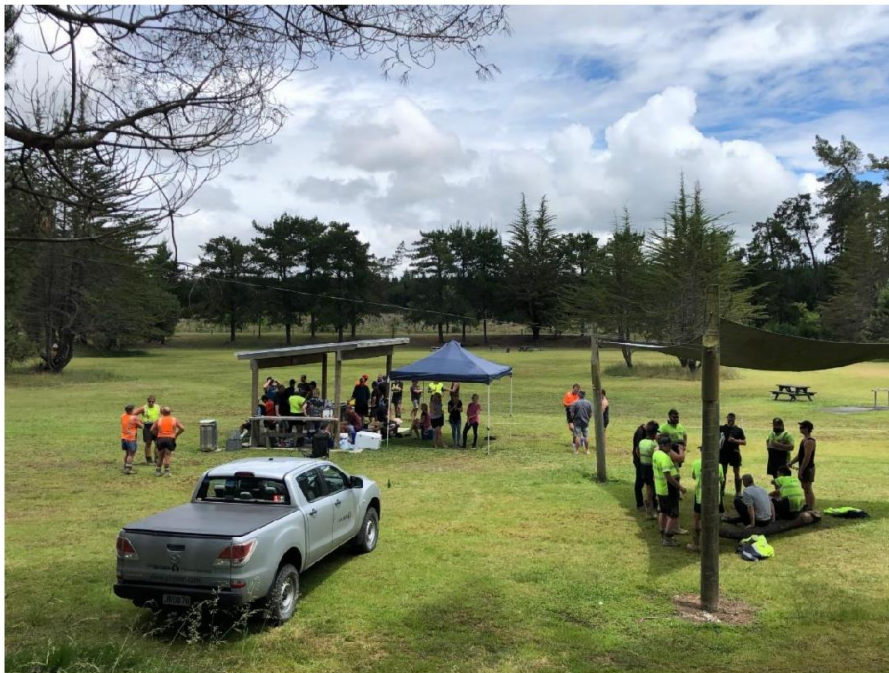
End of year BBQ for PF Olsen contractors