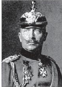
Kaiser Wilhelm II

For the Regency he has decided to appoint Deputy Ebert as Imperial Chancellor, and he proposes that a Bill shall be brought in for the establishment of laws providing for the immediate promulgation of general suffrage and the constitution of a German National Assembly which