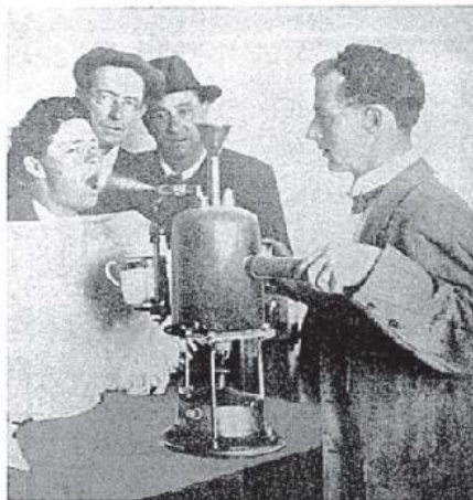
In an attempt to arrest the spread of infection during the influenza epidemic, people attended public inhalation chambers to have their throats sprayed.

Healthy adults proved particularly vulnerable while the young and old, with weaker systems, seemed to have a better chance at survival. The only way to avoid catching the flu was by keeping out of contact with other