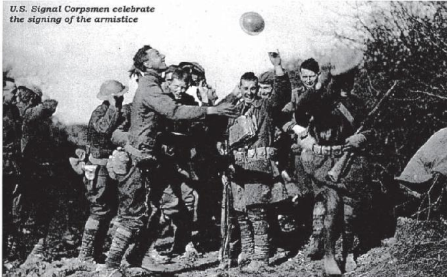
U.S. Signal Corpsmen celebrate the signing of the armistice