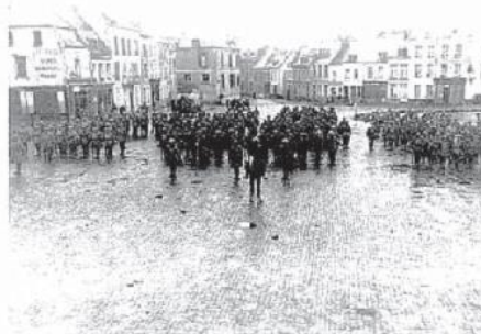
New Zealand troops on parade in Le Quesnoy's square, November 1918

Allied leaders agree that the peoples of Central Empires, having surrendered, must be fed and efforts are being concentrated in that direction.