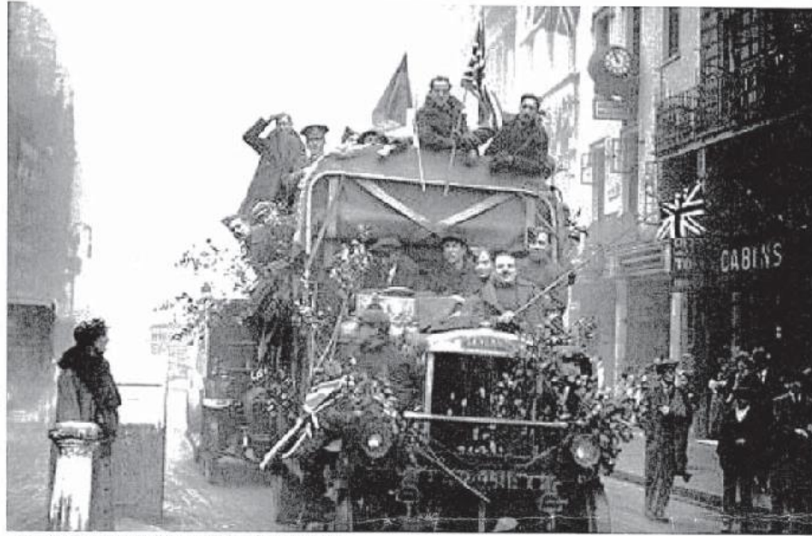
Armistice Day, London, 11 November 1918