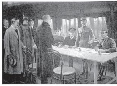
Painting depicting the six signatories of the Armistice in the railway carriage with other participants.