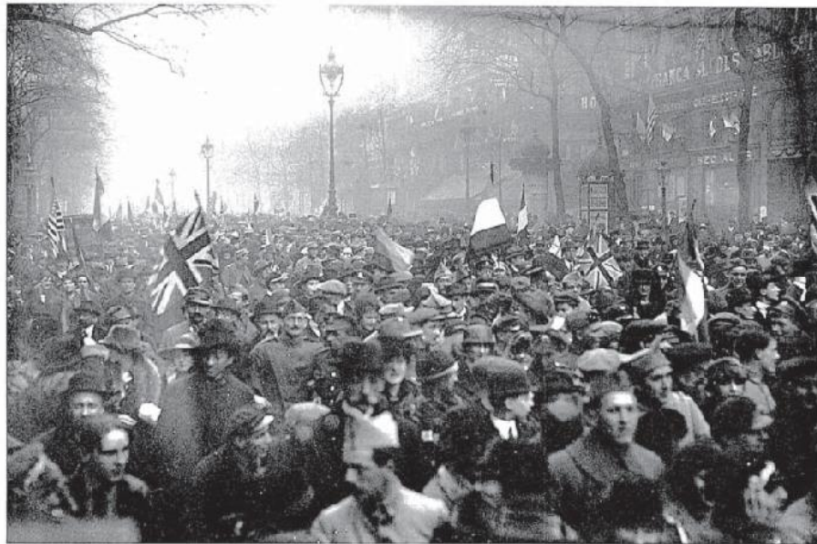
Crowds in Paris hearing the announcement of the armistice, November 1918