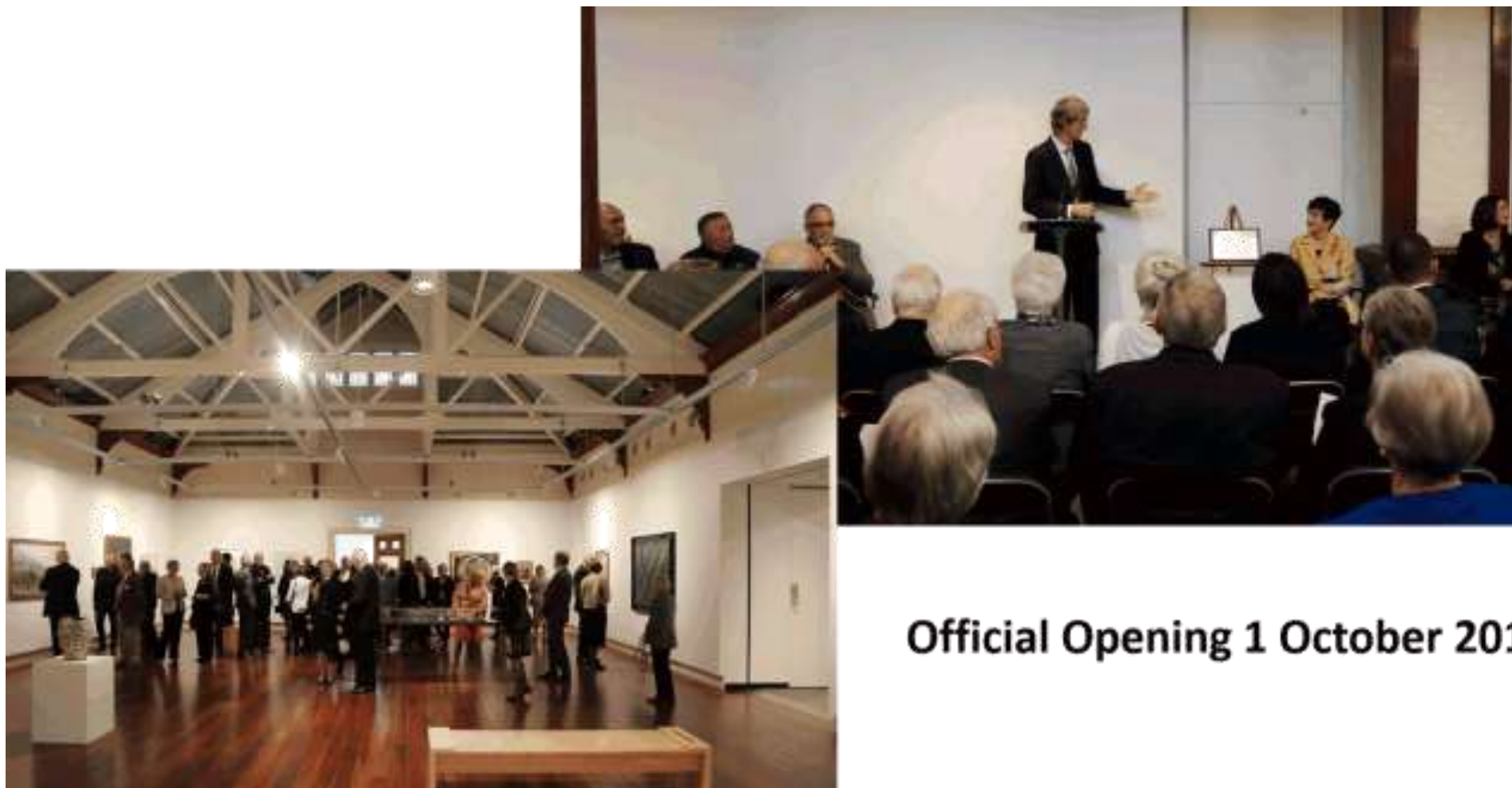
Official Opening 1 October 201