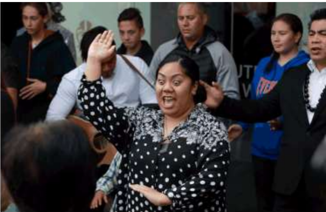
Left: Friends of The Suter and Nelson Suter Art Society Preview 2 nd October; Above: Public Opening 11am, 2 nd October 2016