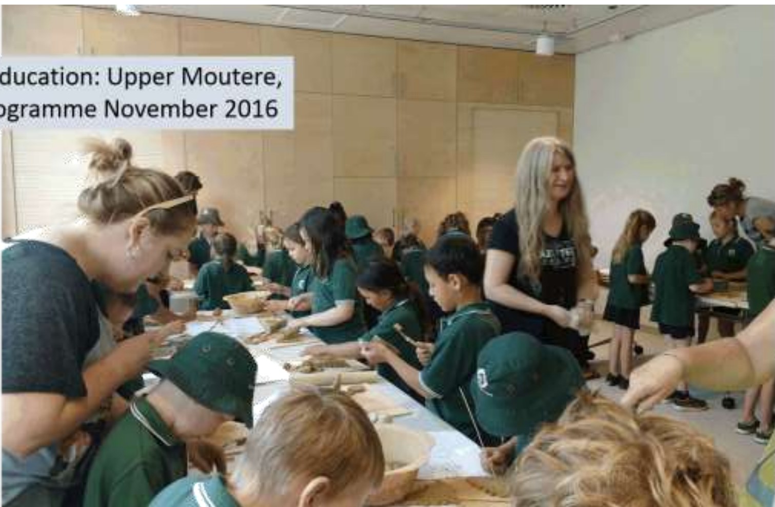
Suter Education: Upper Moutere, clay programme November 2016