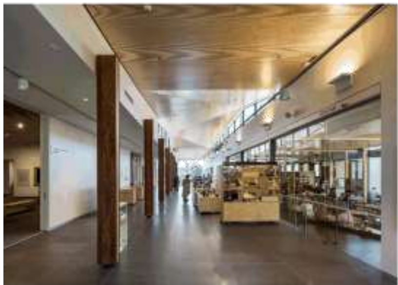
bove: Suter shop in Jane Evans Foyer ight: Suter Café