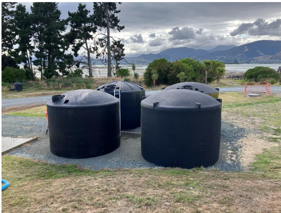
Figure 4: Greenacres Reuse Supply Tanks

causeway have commenced and is scheduled for completion in late February.