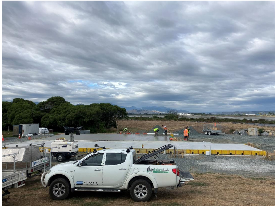
Figure 3: Facilities/Workshop Building Foundation