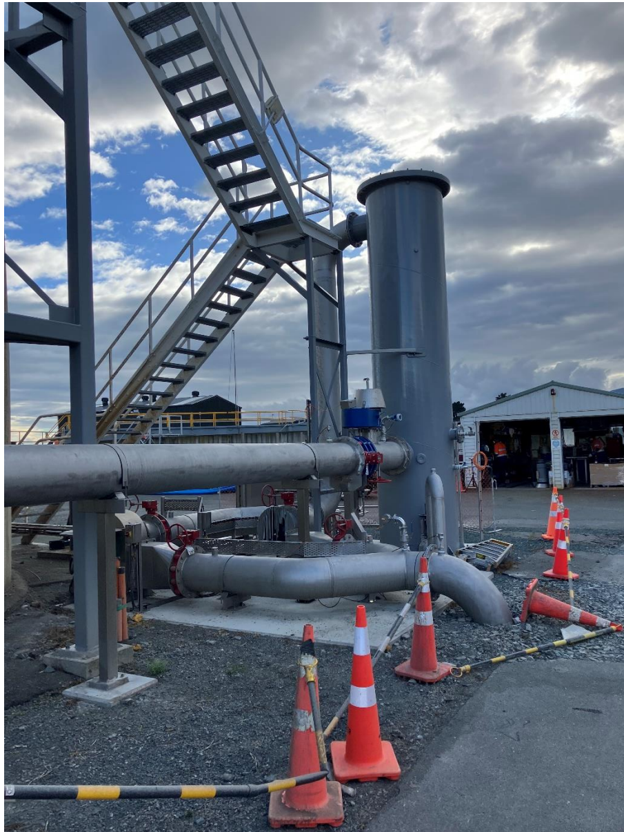
Figure 2: ADAT Ammonia Scrubber & Blowers