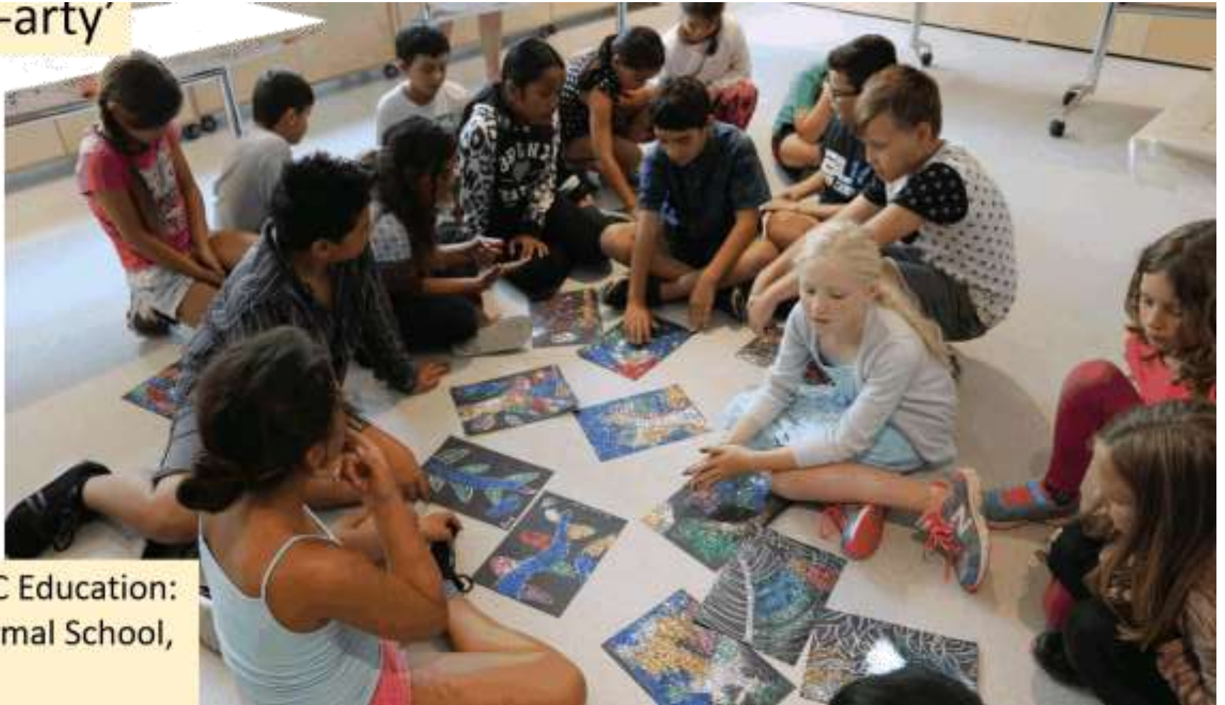
After LEOTC Education: Central Normal School, April 2017