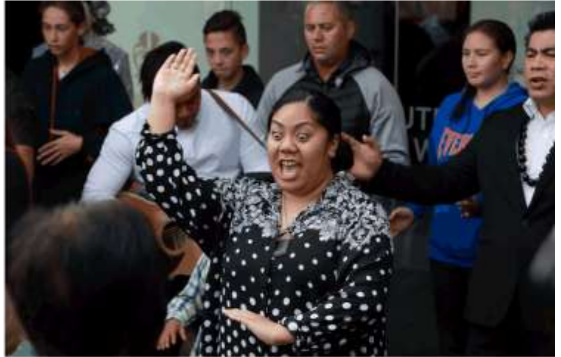
Left: Friends of The Suter and Nelson Suter Art Society Preview 2 nd October; Above: Public Opening 11am, 2 nd October 2016