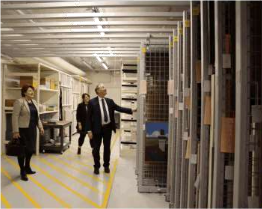
ection storeroom: State of the art storage, climate control, fire action and security systems