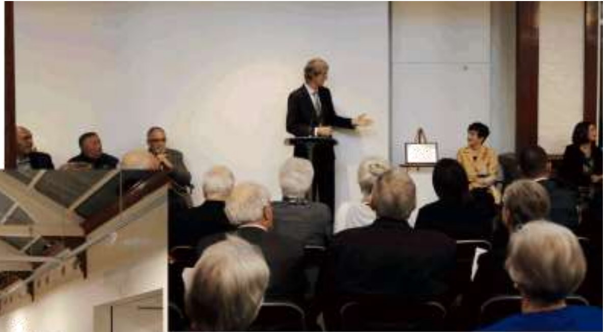
Official Opening 1 October 201