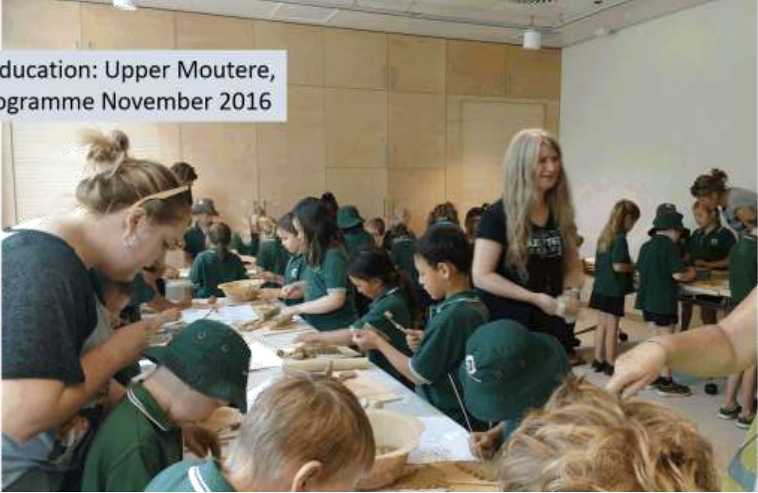
Suter Education: Upper Moutere, clay programme November 2016